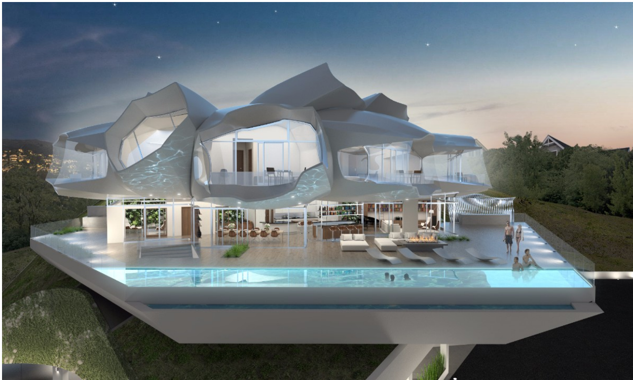
a rendering of Baumgartner and Uriu's Hollywood residential project