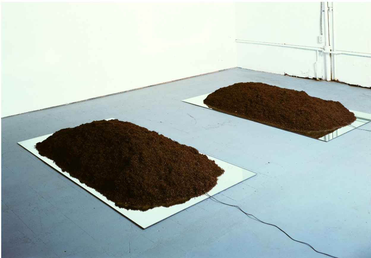
"Partially Buried 1960s/70s Dystopia Revealed and Utopia Reflected"