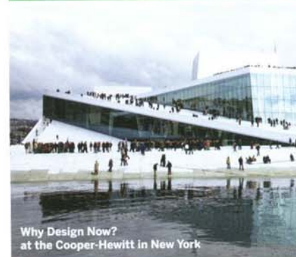
Why Design Now? at the Cooper-Hewitt in New York