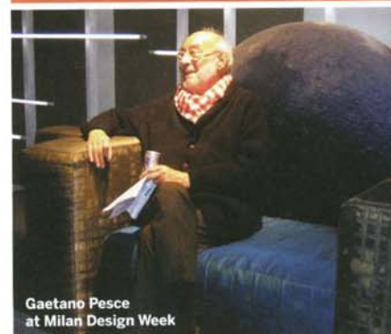
Gaetano Pesce at Milan Design Week