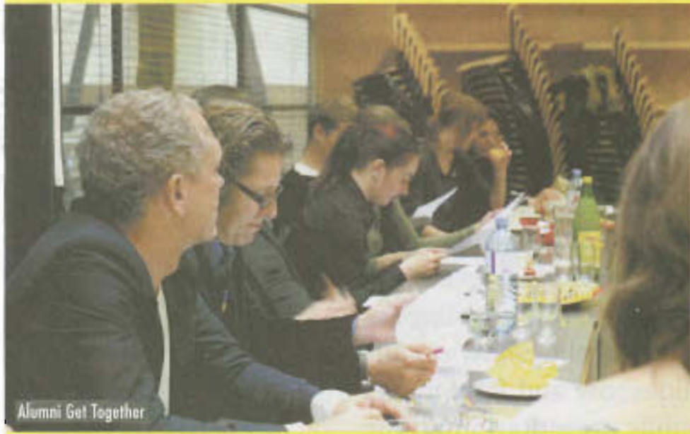
Alumni Get Together