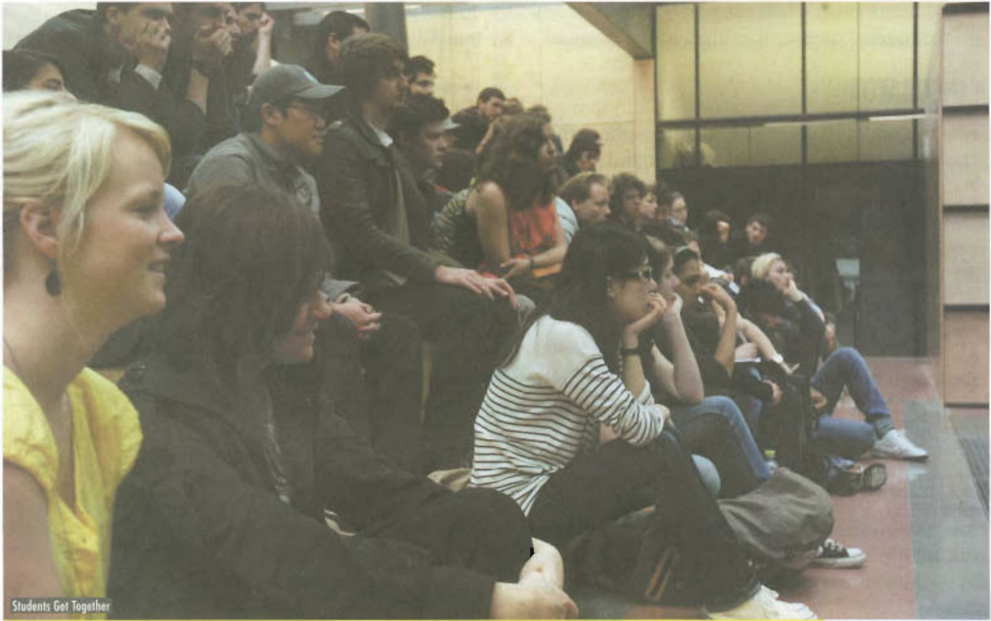
Students Get Together